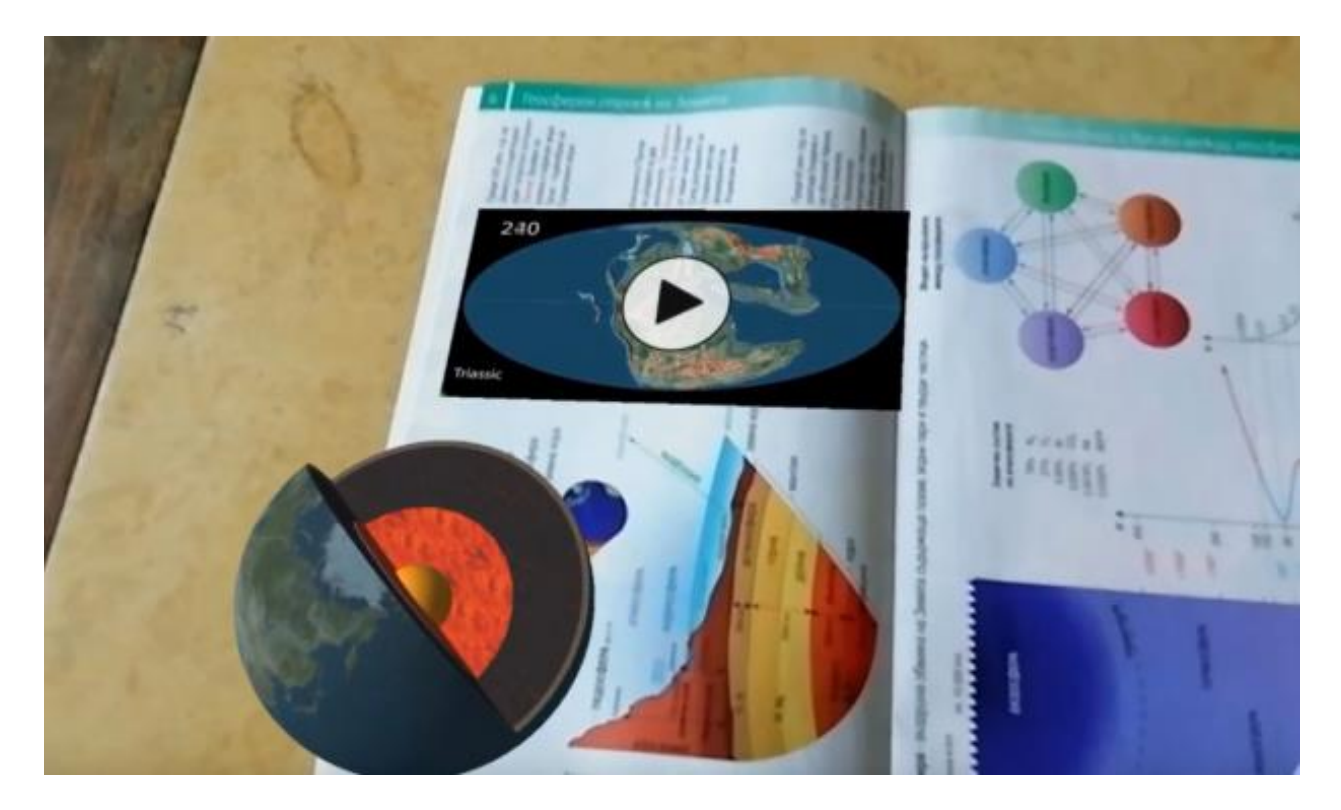
Fig. 2. AR on the base of paper school atlases [Yonov, 2019]