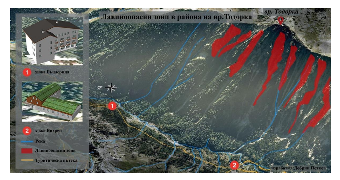
Fig. 1. 3D map of the avalanche zones in the west area of Todorka peak, Pirin Mountain, Bulgaria

The advantages of 3D cartographic models are that relative heights and depths are better conveyed in 3D, and that the relationship between design and human dimensions is easier to grasp. The disadvantages are that 3D cartographic models will be more difficult to create and modify than 2D cartographic models.